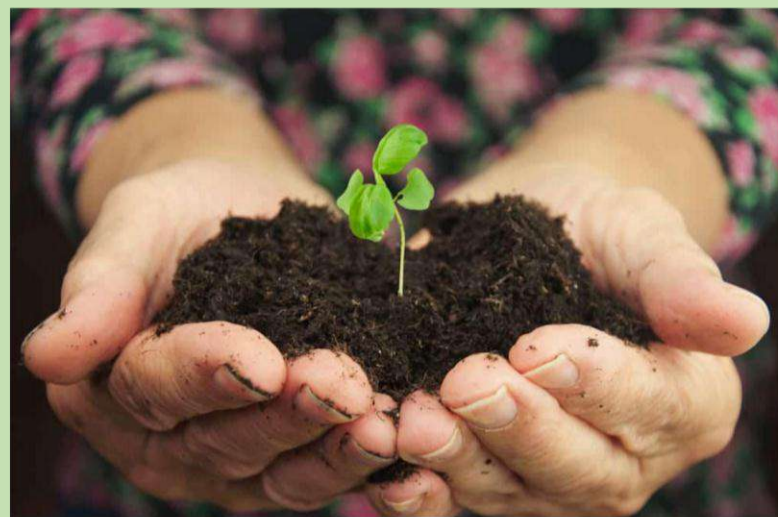
A Manure made from composting

Class 8 as an outdoor activity did Composting in the earthen pot, backyard of the school .Student Collect kitchen waste and continue to add layers till the bin was full. It was maintained for 2 months and then it was harvested .