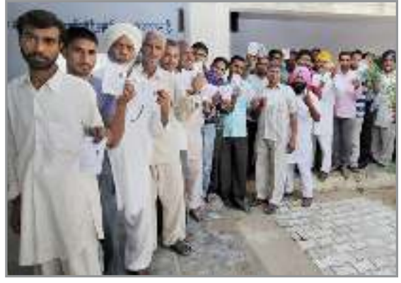
Queue outside a polling booth

People's participation does not end even after the elections. It is also to be seen when government is formed by the elected representatives. In day to day life, people closely watch the activities of various departments of the government and criticise also, if required. They also guard their own rights and freedom given to them by the Indian Constitution.