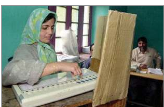
A woman casting vote