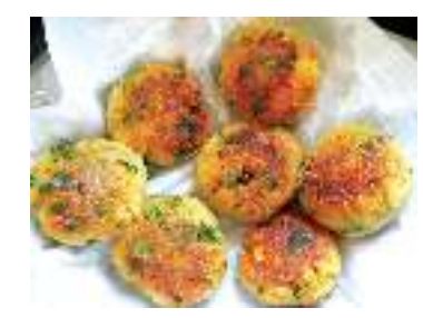
Healthy Food Options