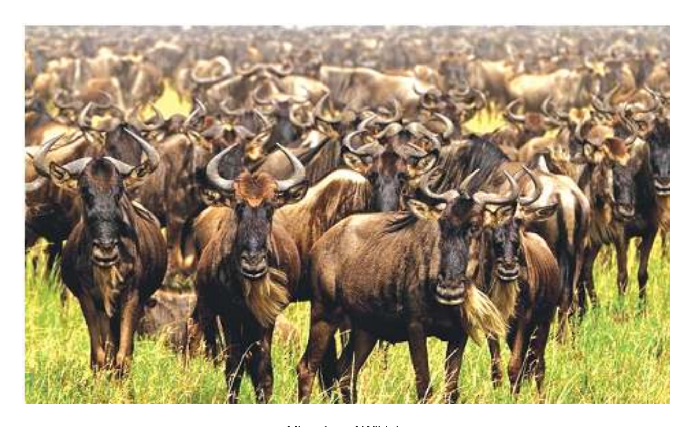
Migration of Wildebeests

Animals migrate with change in seasons. They migrate to find warmer weather, better food supply or safe place to give birth to their young. Animals do not follow a map or GPS. They know which direction to follow. They learn this from their parents and have a special sense! Caribou live in snow-covered areas. They migrate to warmer areas. Wildebeests of Africa migrate in search of green pastures, crossing many crocodile filled rivers. This great migration is known as one of the "Seven Wonders of the Natural World".