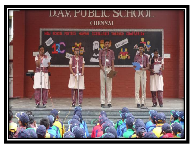
Around the World in 3 Minutes

TOPIC : How School Fosters Human Excellence Through Compassion – 3 Ways