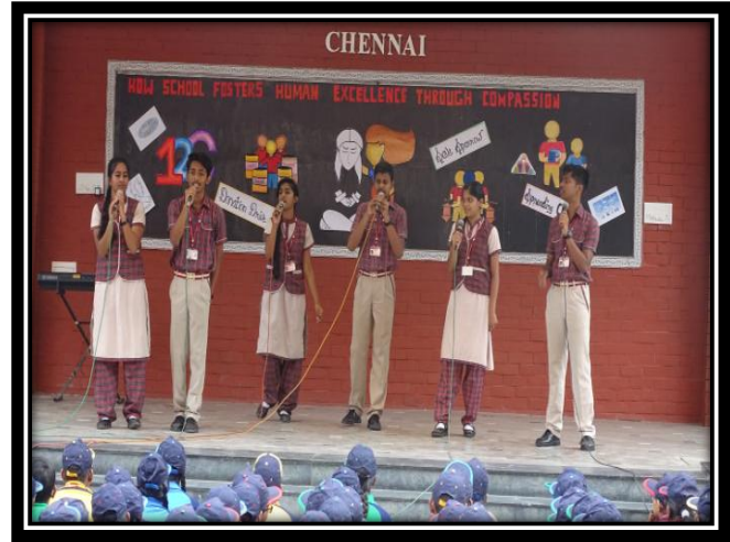
Music – The Strongest Magic