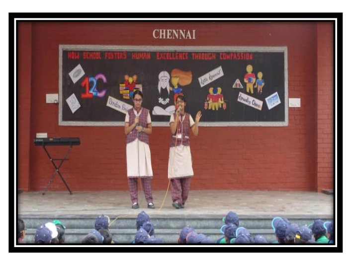
Words of Compassion