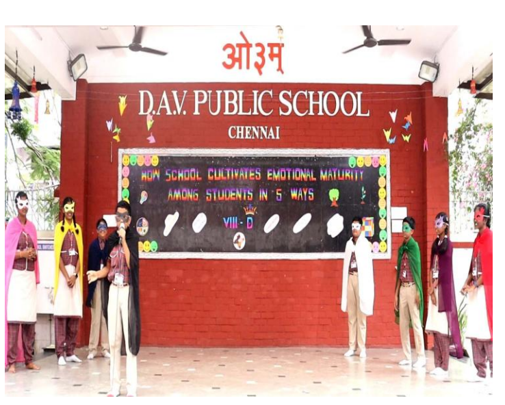
Vivid Walk of Hues