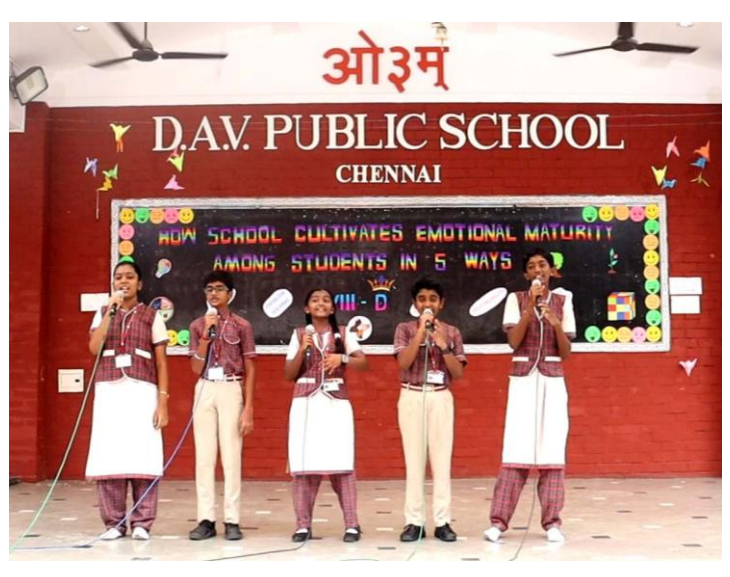
Rhythmic Song on Responsibility