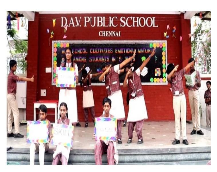
Topic introduction on 'Emotional Maturity'