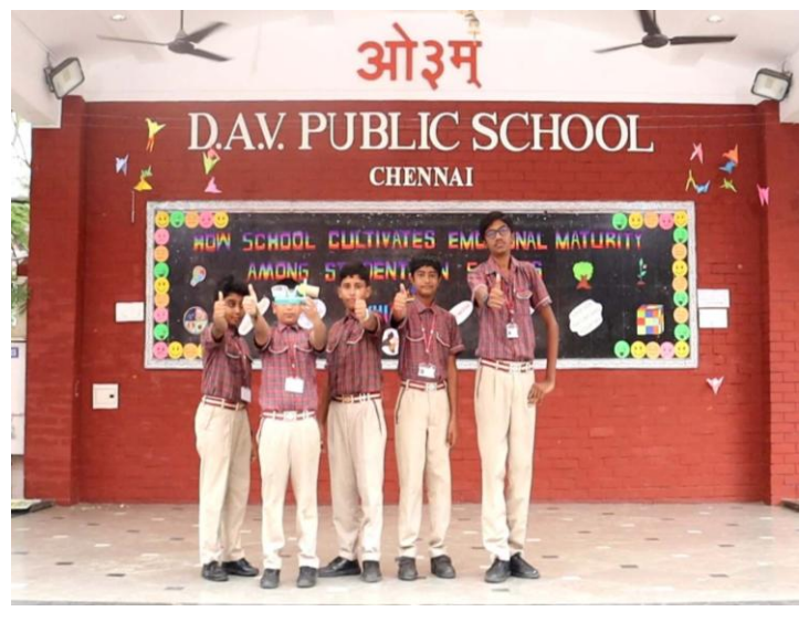
Team work makes Dreams Work