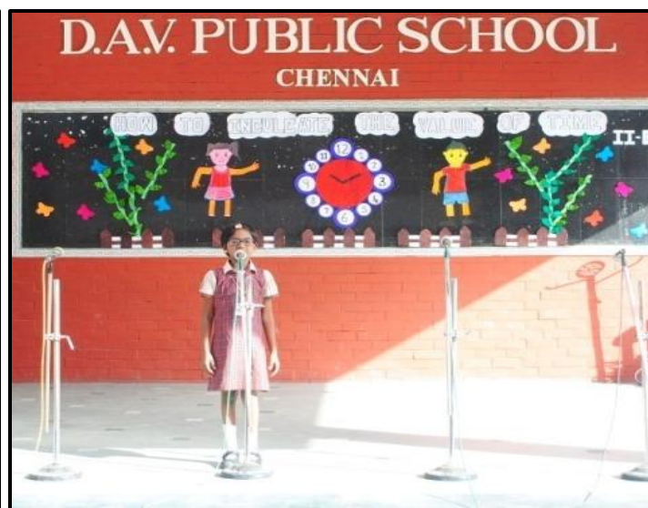
Rendition of a poem on 'Inculcating the Value of Time'