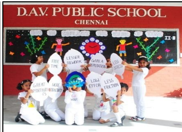
A foot tapping dance performance on 'The Benefits of Time Management'