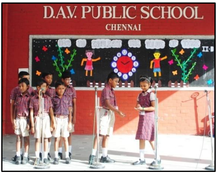
'Time is Precious' - A Skit