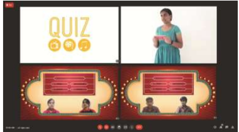
'Grey Matter' – a quiz for competence in current affairs