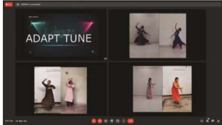
'Adapt Tune' a face off from the graceful dancing divas