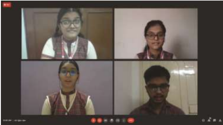
The anchors facilitate the proceedings