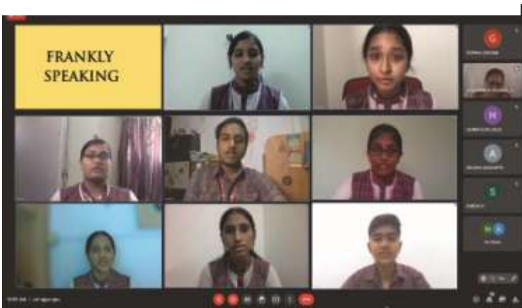
'Frankly Speaking'- the eloquent speakers lock horns in a debate