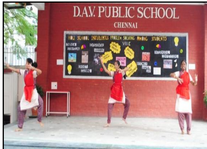
Dancing to Classical Music played on the Spot