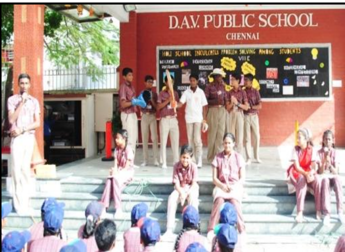
News Makers of VIII E 2019 - 20