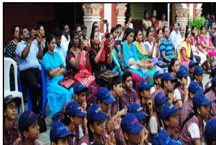
Parents witnessing their wards' Problem Solving Skills