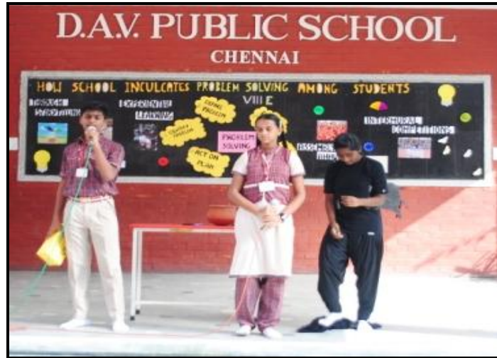
The Modern Thirsty Crow – ‘Can You Solve’ ?