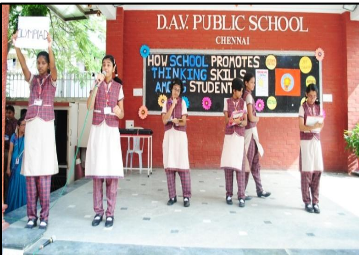
Olympiads – To hone the students’ Thinking Skills