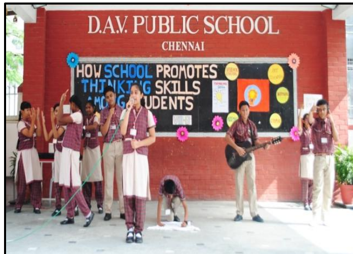
Intermural Competitions – A way to develop students’ Thinking Skill