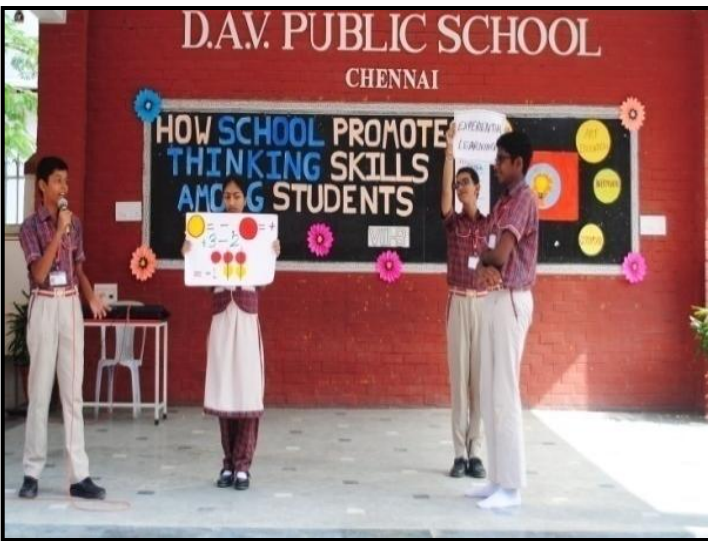
Experiential Learning – ‘Learning by Doing’

TOPIC : HOW SCHOOL PROMOTES THINKING SKILLS AMONG STUDENTS – 5 WAYS