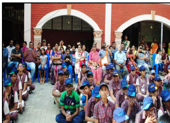
Parents watching their wards’ scintillating performance