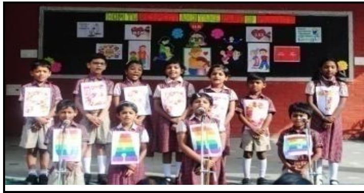
Seeing Parents as their Saviour - Song