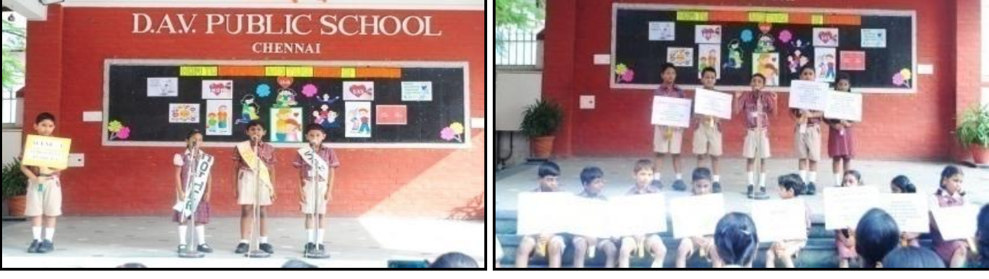
Words of Love and Affection being showered on their Parents