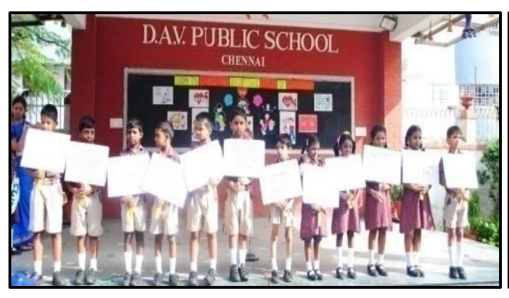
A Placard Depicting Parent's Love and Care