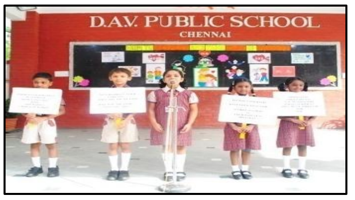
We are blessed to have such loving Parents