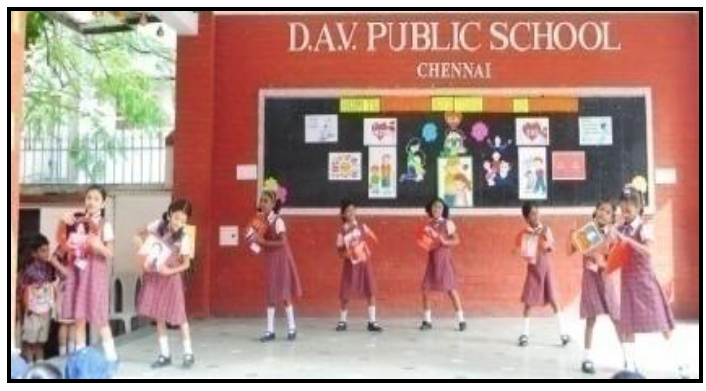
Paying tribute to the Parents

Expression of gratitude to their Parents through Dance