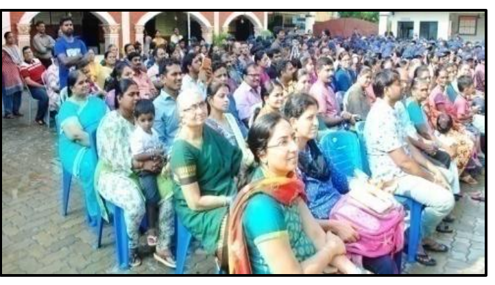
Parents beaming with pride after watching their ward's Performance