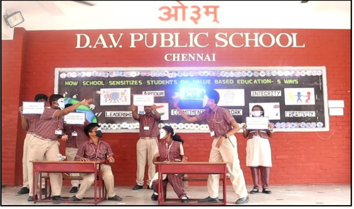
Tone prevailing across Integrity was portrayed through a mime