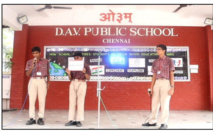
Quintessence of the day on Value Based Education