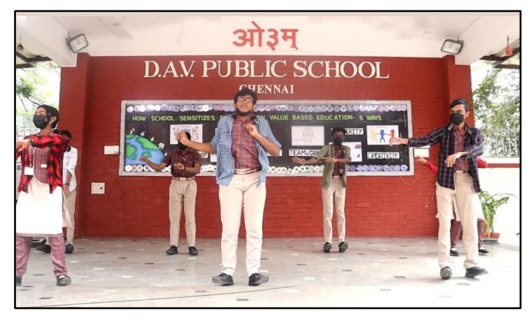
Enthralling Dance Performance