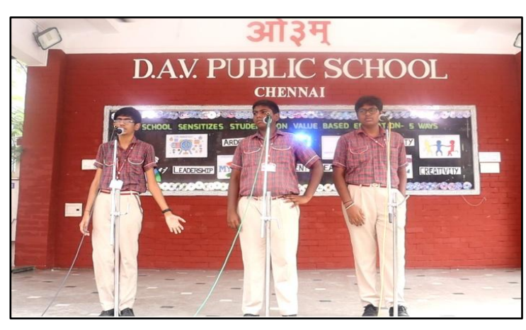
Tinges of the theme