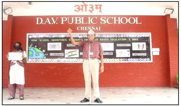
Annotation of Veerapandiya Kattabomman