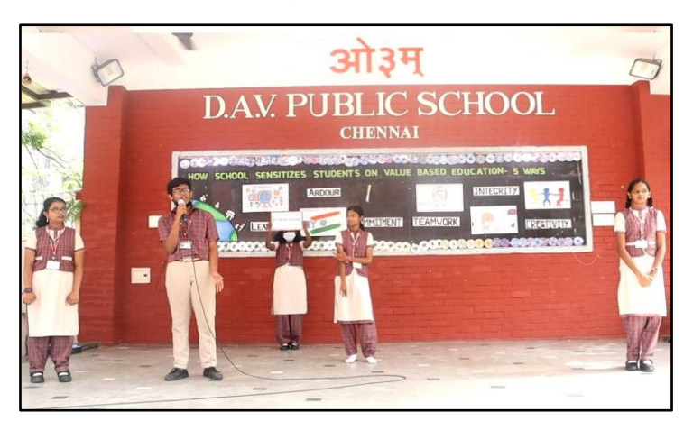
Quiz on Indian Virtue of Vasudhaiva Kuttumbakkam