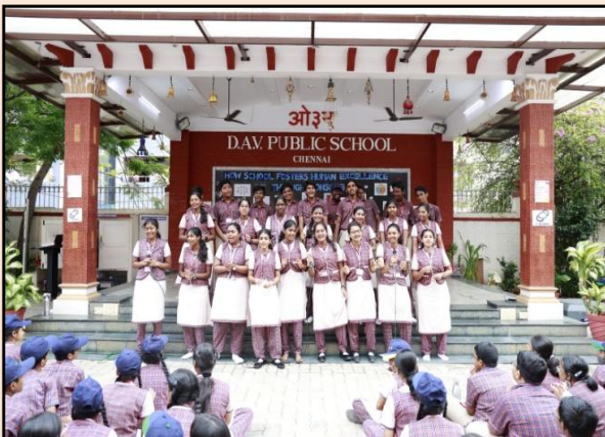
'Who Says?' Captivating Musical Treat On Self Confidence by XI A