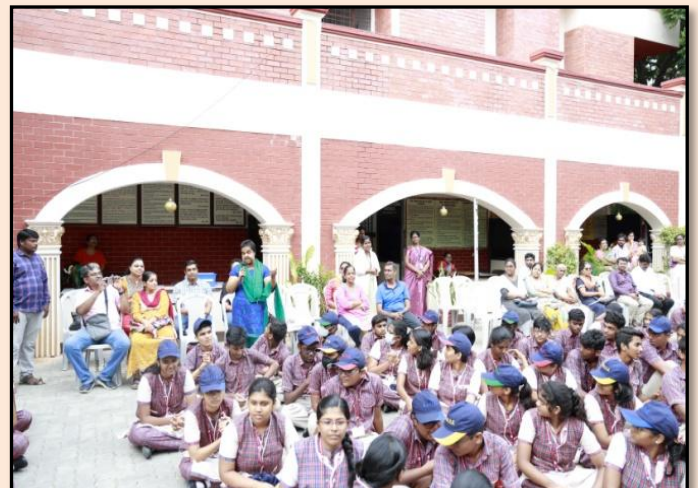
Words of Appreciation and Gratitude by Parents