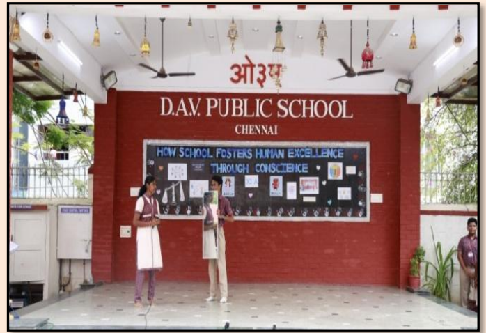
Role Play depicting the Message 'Conscience is Your Best Friend'