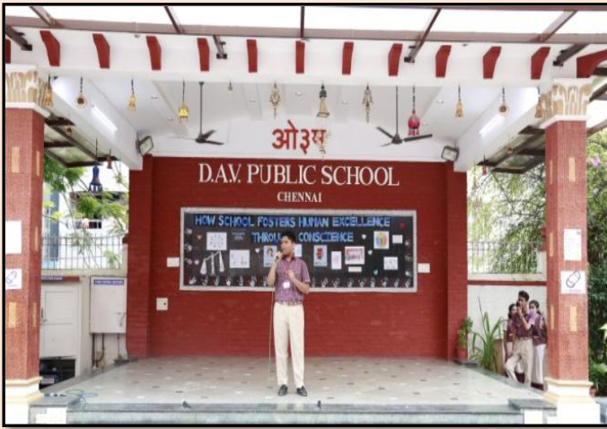
Introducing Assembly Theme to the Audience