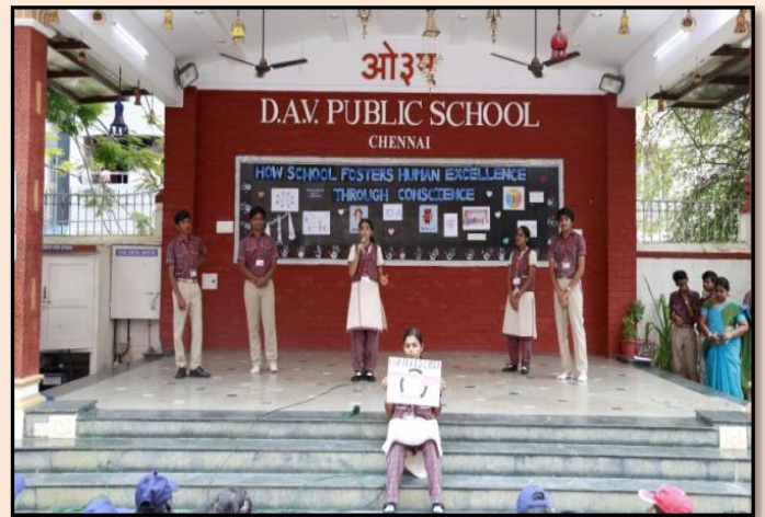
Talkathon on School's Role to Make Students Conscience Driven