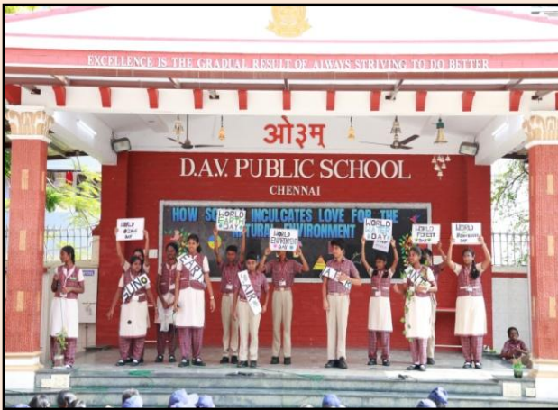
“Saviours of Nature- DAVites” – A short Skit