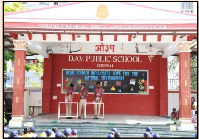
Techculture- Technology Showcase to protect nature