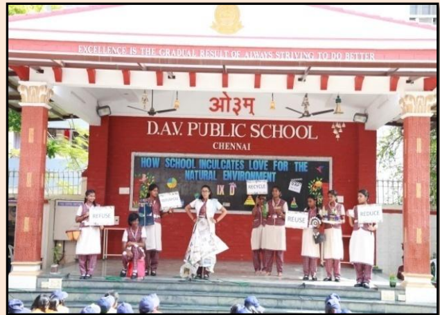
“Green Glam Show” – A fashion parade on 5 R’s