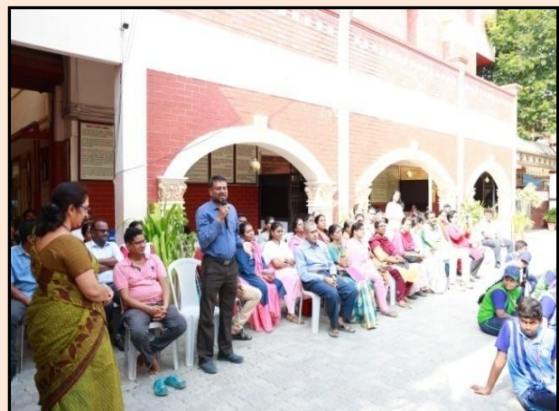
Words of Appreciation from Parents