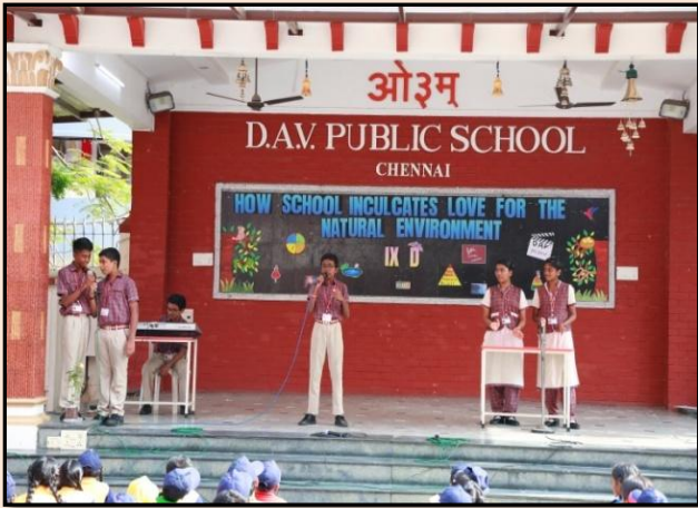
An Energetic Welcome Rap