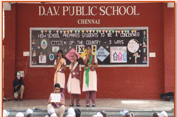
Melodious Ensemble – The Song