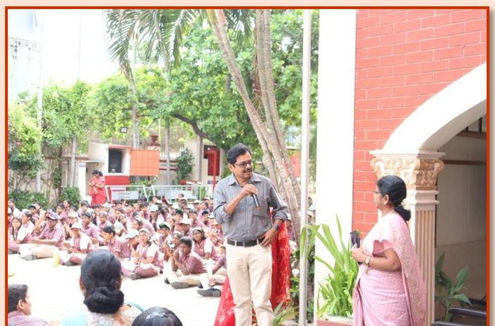
Parent's Positive Feedback on School's Effort to Instill Human Values