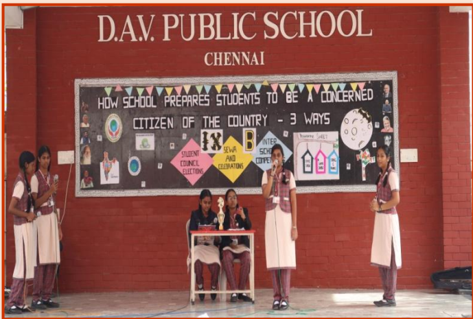
Minute to Win It – The Game Show