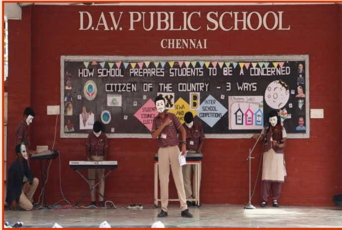
The Mime Show